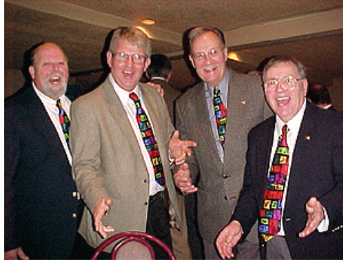
Principal quartet of the evening, The Footlighters