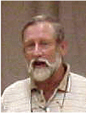
The NYOY himself, a few days before the dinner