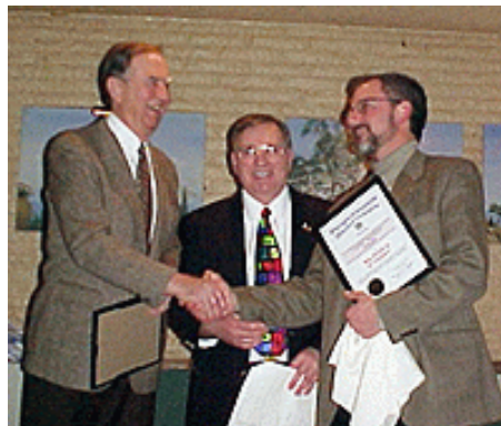
The Phishermen are honored