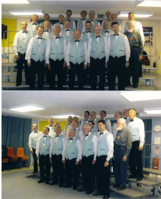
The Downsmen of Epsom, Surrey, England, with a visitor

They were preparing for a performance soon, and so they all had their uniforms, which include a sizable gold-colored medallion on a green ribbon. See the accompanying pictures, in which I am fairly obvious by my not being in uniform. Nobody mentioned the significance of the medallion, and I didn't ask.