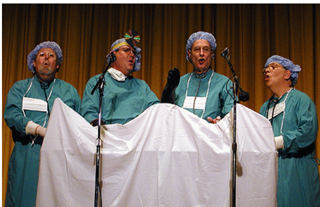
Is there a doctor in the house? The Footlighters in action