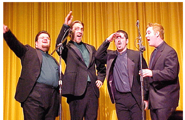
Conundrum shows their mettle