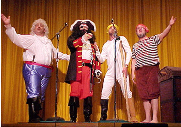
Reveille for—or as—some pirates