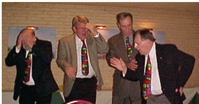
The Footlighters in a more informal mood.